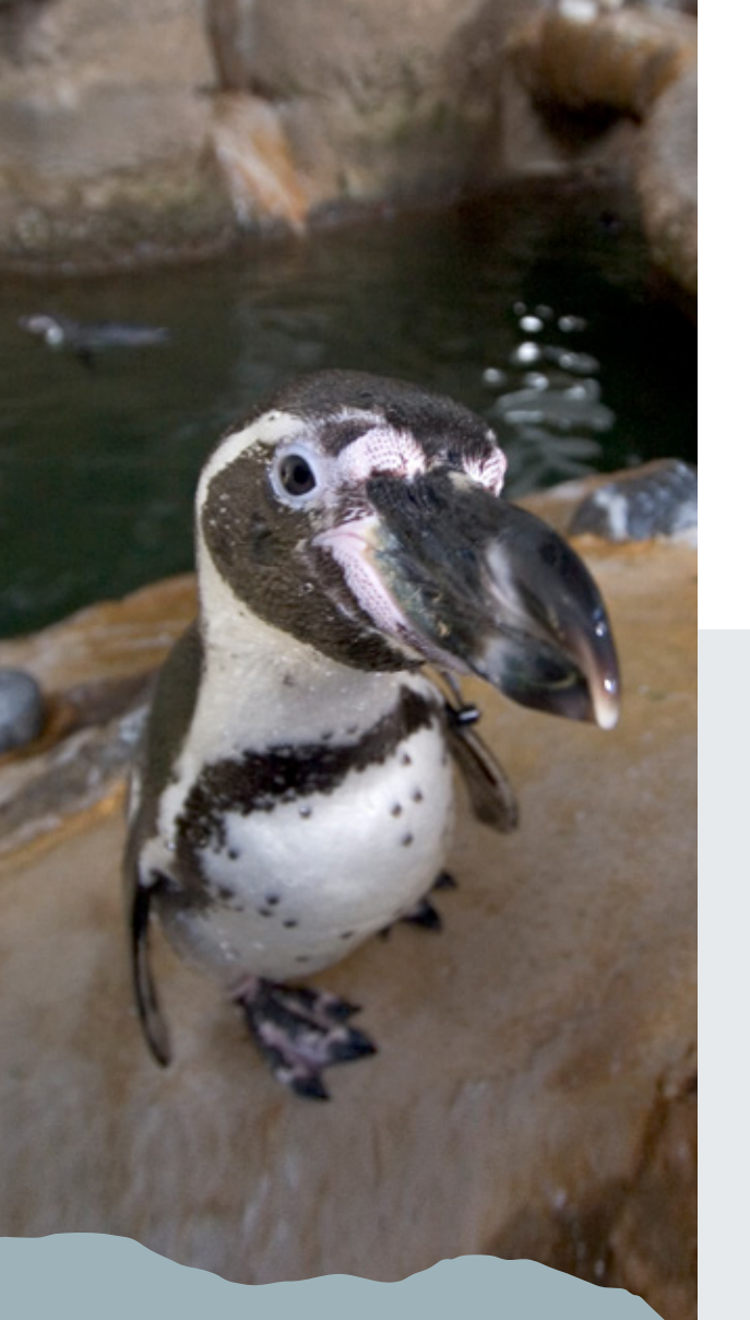
You can help Humboldt penguins in the wild by choosing sustainably harvested fish at the market. Visit www.seafoodwatch.org to learn more.